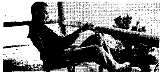
At Glacier Park, July 1940.